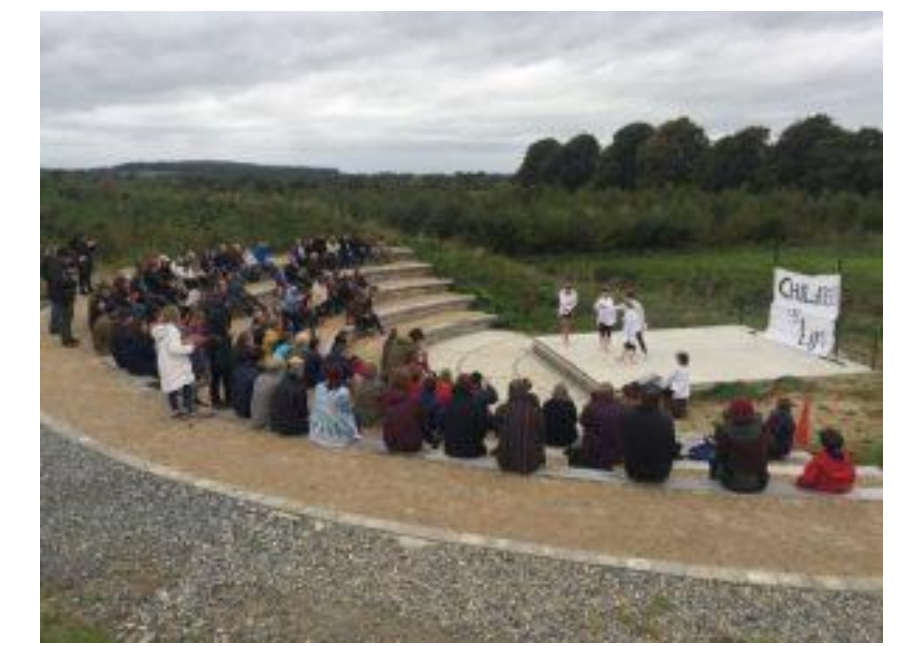
next...22 September 2018