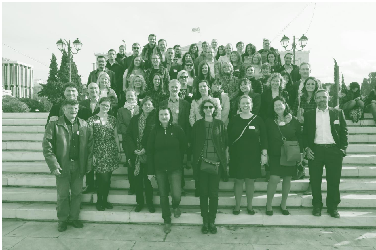
Good Practice Workshop no. 6 (30 Nov./1 December 2017 in Athens)

https://enrd.ec.europa.eu/evaluation/good-practice-workshops_en