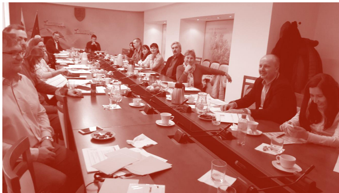
EvaluationWORKS!2017 (16 Nov. 2017 in Bratislava)