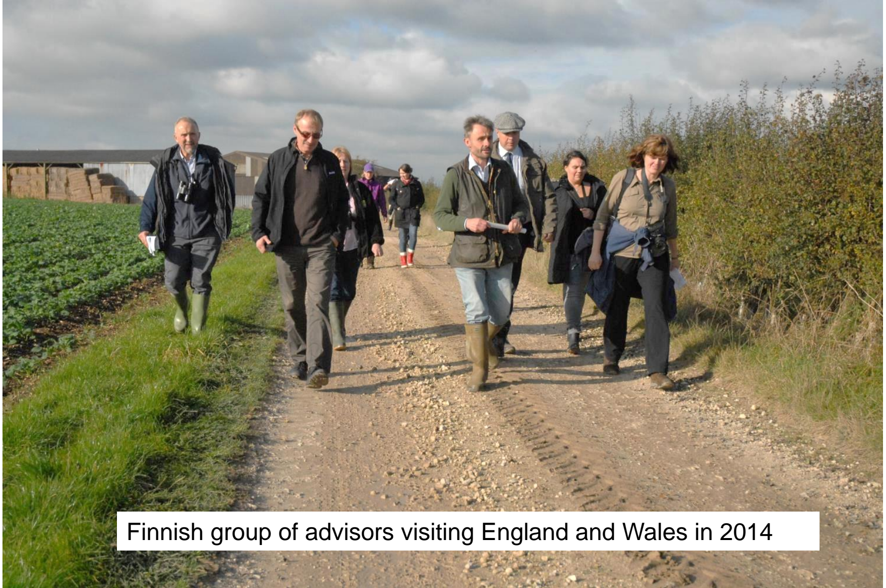
Finnish group of advisors visiting England and Wales in 2014