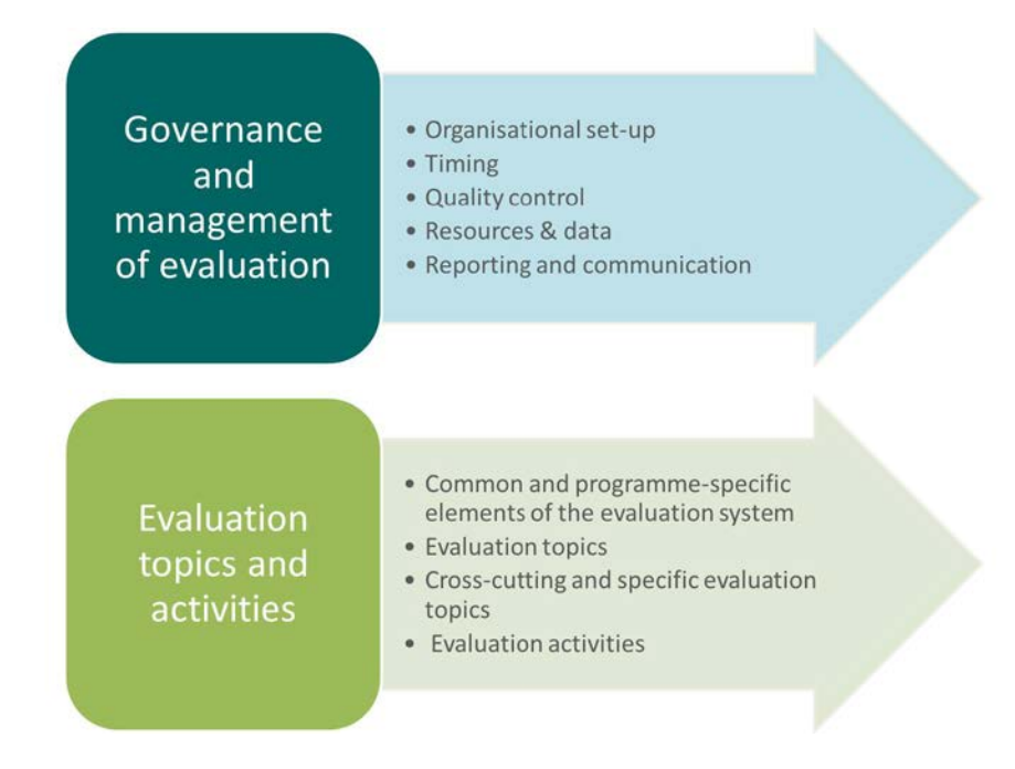
Figure 2. Structure of Part II of the guidelines: