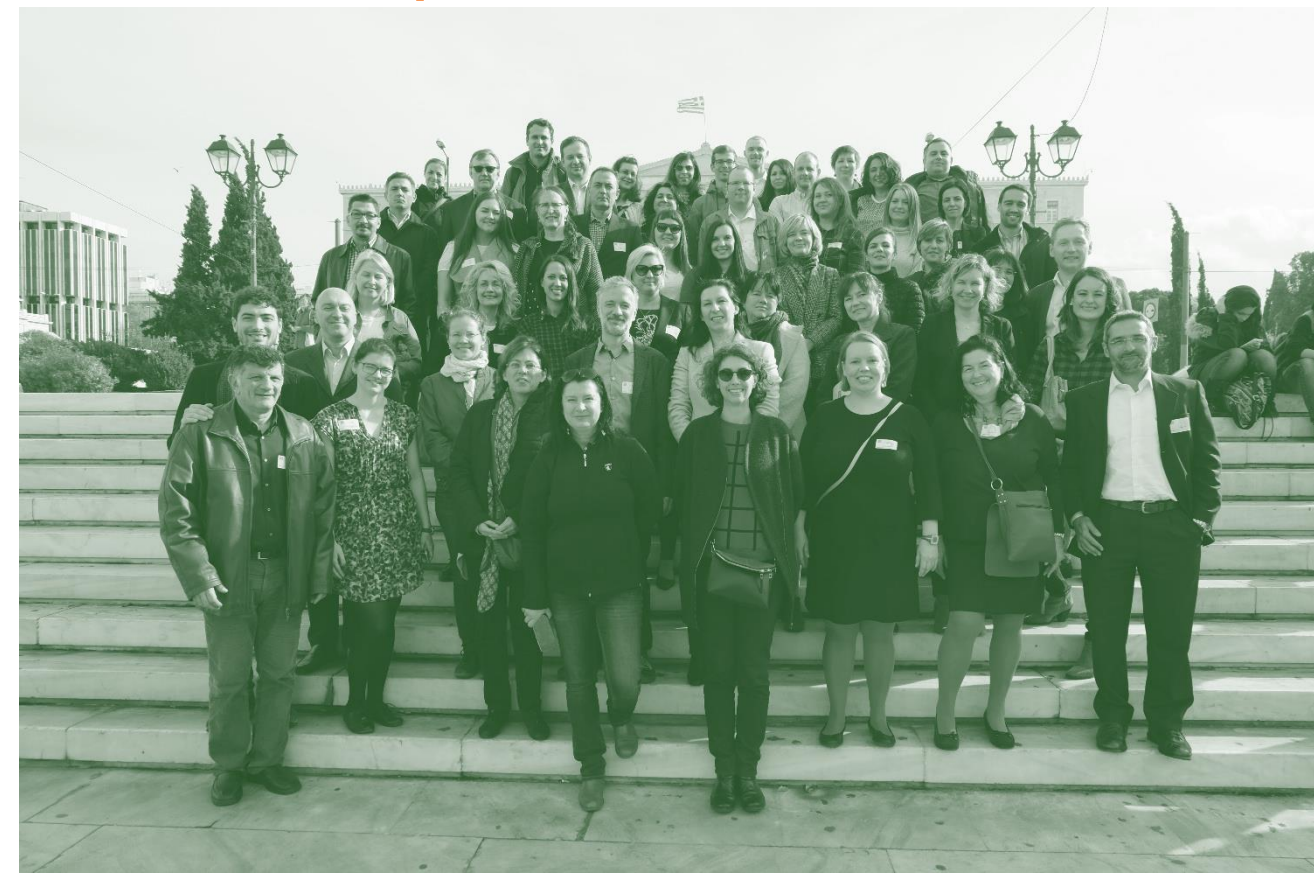
Workshop #6 (30 Nov./1 December 2017 in Athens): Evaluation and National Rural Networks: How can NRNs support evaluation?