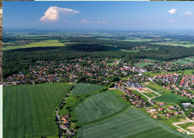
Mukarov, Czech Republic