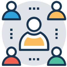
Meeting 1 (17 March 2022)