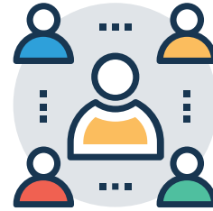
Meeting 2 (1 June 2022)